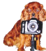
From Behind the Lens Gladys Calhoun

I imagine this information is available for many other airports around the nation as well.”